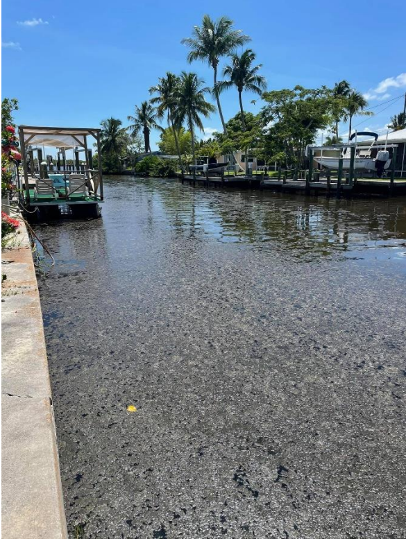
Matlacha Canal, May Street with floating macro algae, 7-30-21