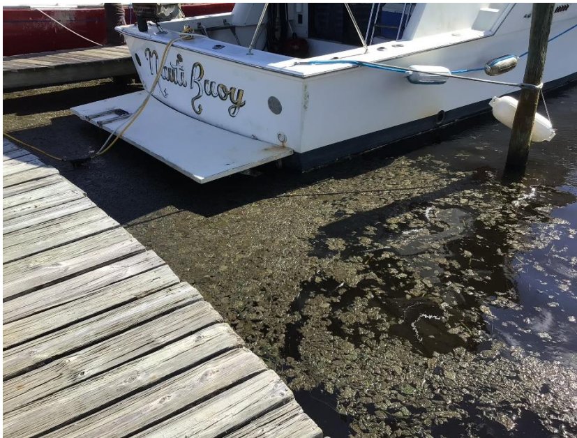
Olde Fish House Marina, 7-29-21