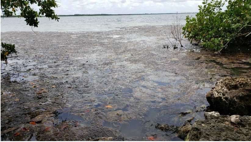
6-14-21 Matlacha County Park looking SE