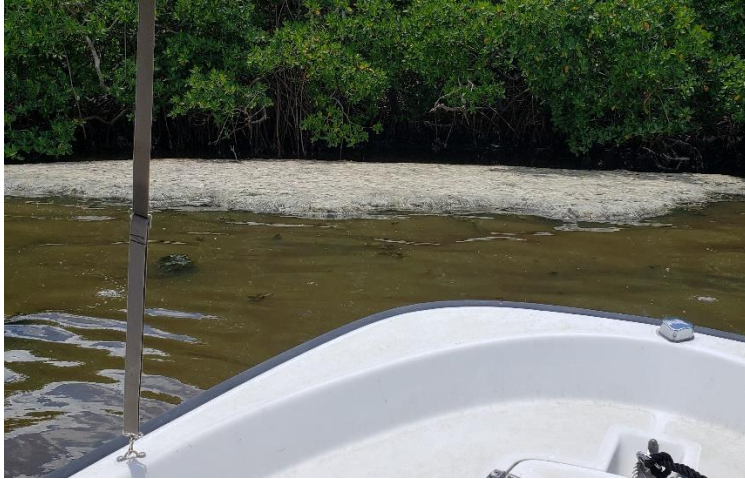
7-16-21 Matlacha Pass