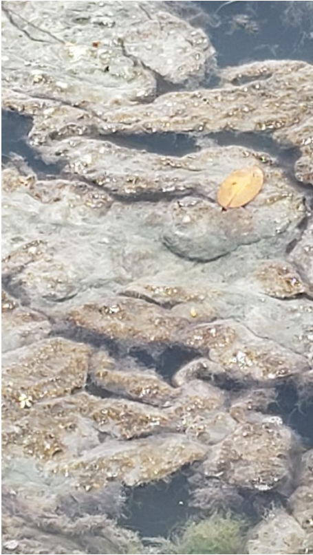
6-14-21 Matlacha County Park eastern shore