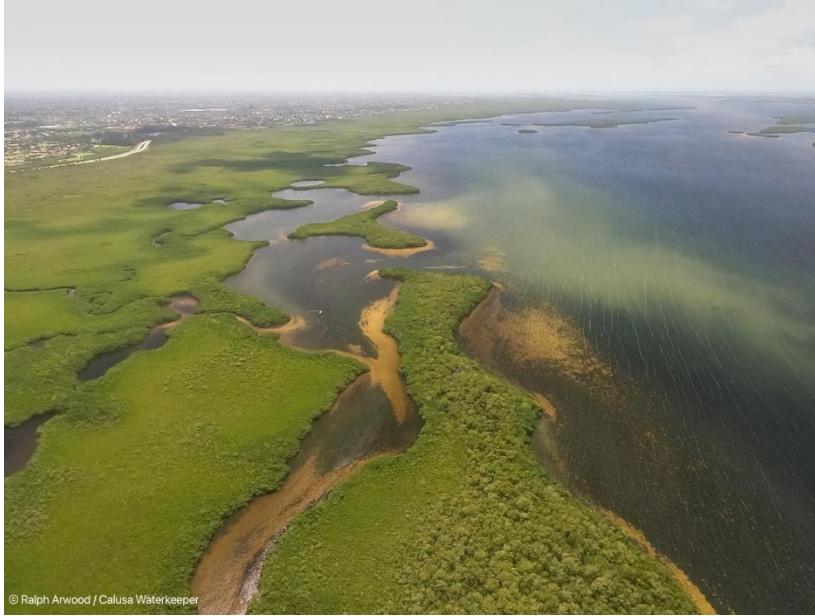
Photo chronology of milky water and surface algal mats in or associated with Matlacha Pass State Aquatic Preserve.