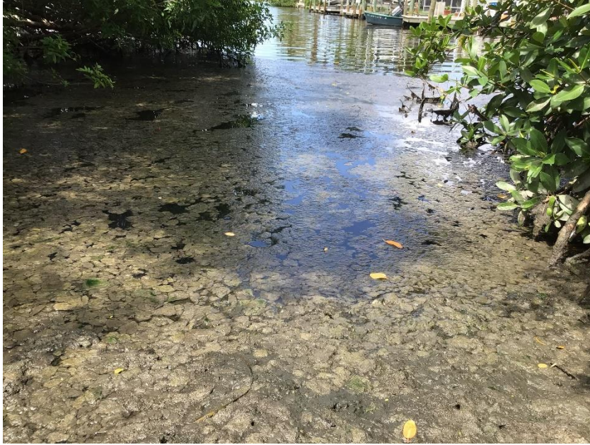
Lee County Park, Bat House Park, Matlacha 7-29-21